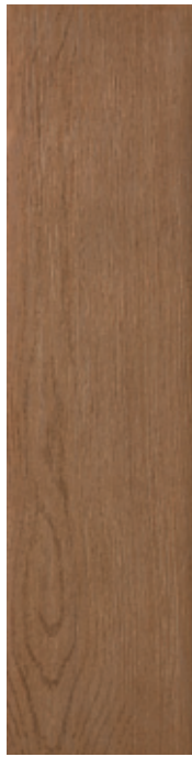
AD73 Iroko 15x60 AD85 Iroko 15x60 Grip 15x60 - 6"x24"