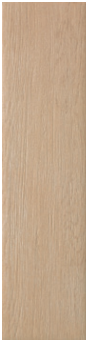
AD71 Frassino 15x60 15x60 - 6"x24"