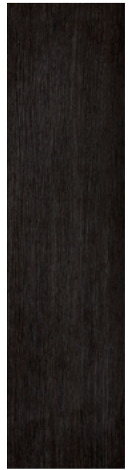
AD75 Wengè 15x60 AD87 Wengè 15x60 Grip 15x60 - 6"x24"