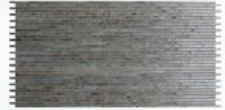
Manhattan Bronzo 30x60 cm su rete