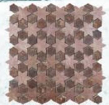
Cometa Ferro/Ossidi 31x31 cm su rete