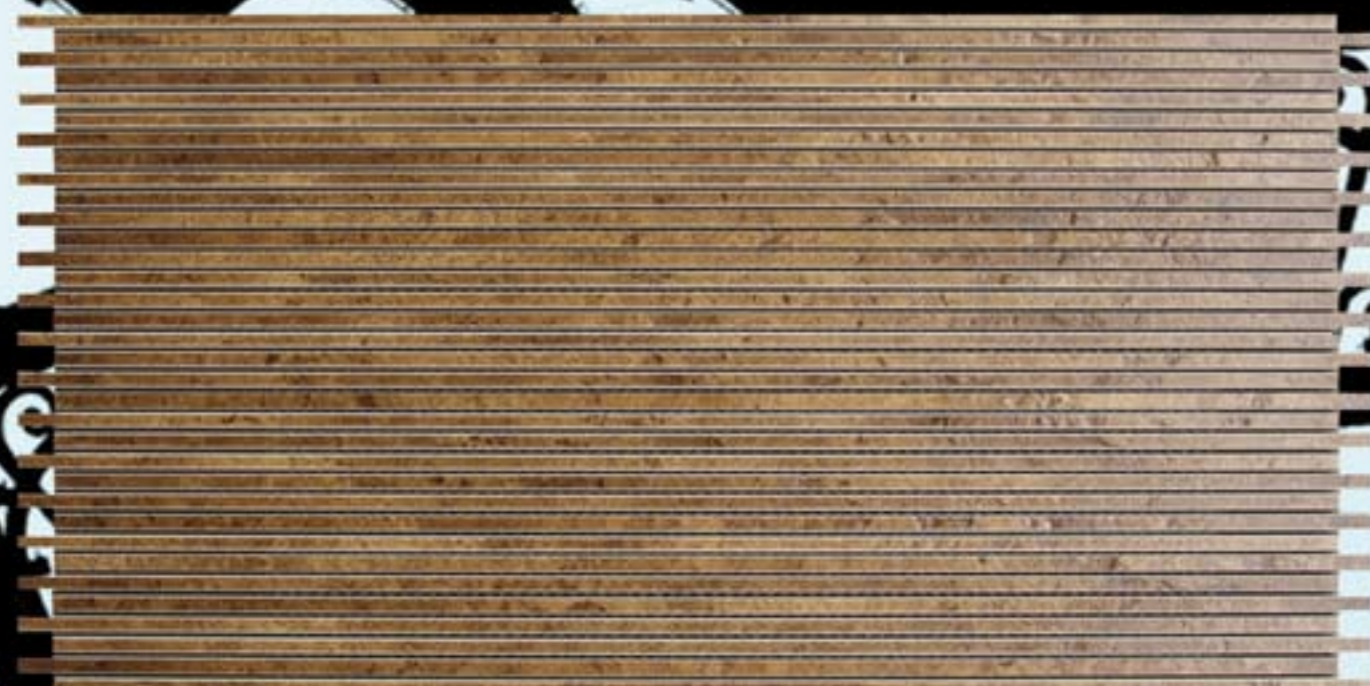
Manhattan Ottone 30x60 cm