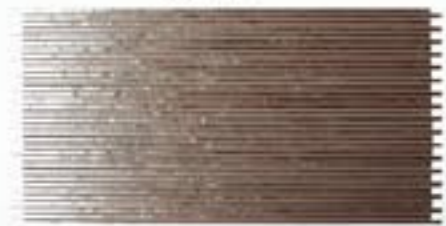
Manhattan Argento 30x60 cm su rete