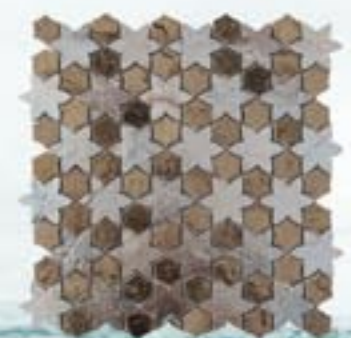
Cometa Oro/Argento 31x31 cm su rete