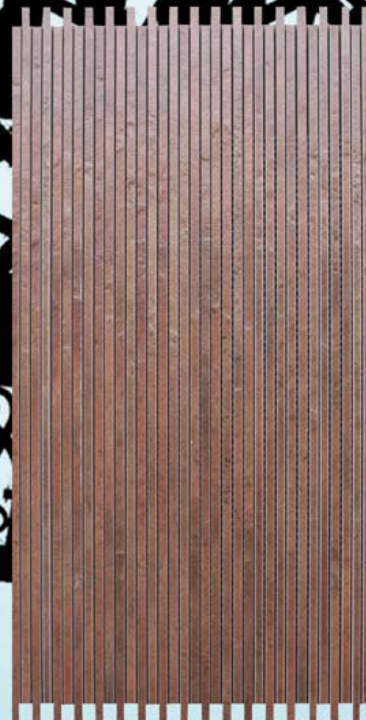
Manhattan Rame 30x60 cm