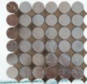
Luna Argento 31x31 cm su rete