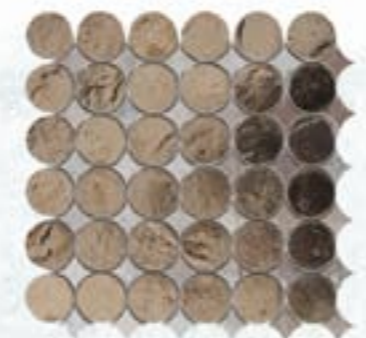
Luna Oro 31x31 cm su rete