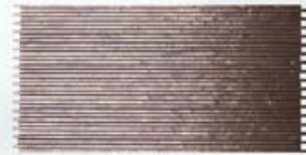
Manhattan Ossidi 30x60 cm su rete