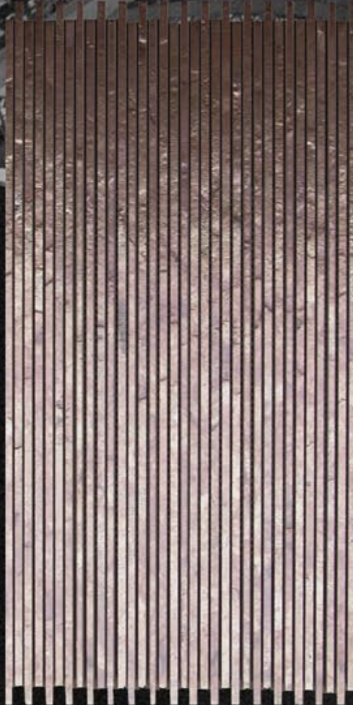
Manhattan Ossidati 30x60 cm