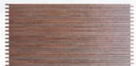
Manhattan Flame 30x60 cm su rete