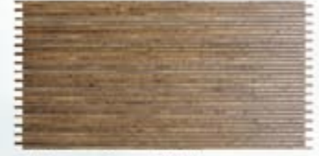
Manhattan Ottone 30x60 cm su rete