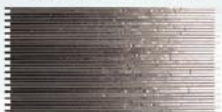
Manhattan Piombo 30x60 cm su rete