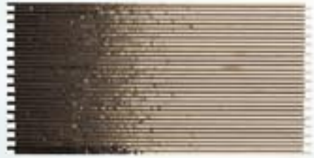
Manhattan Oro 30x60 cm su rete