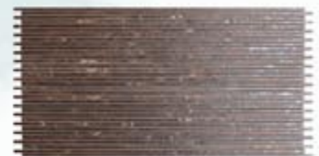
Manhattan Ferro 30x60 cm su rete