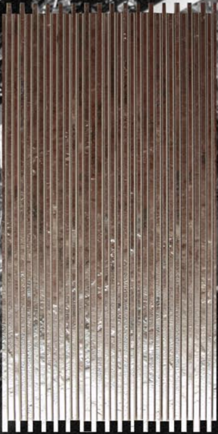
Manhattan Argento 30x60 cm